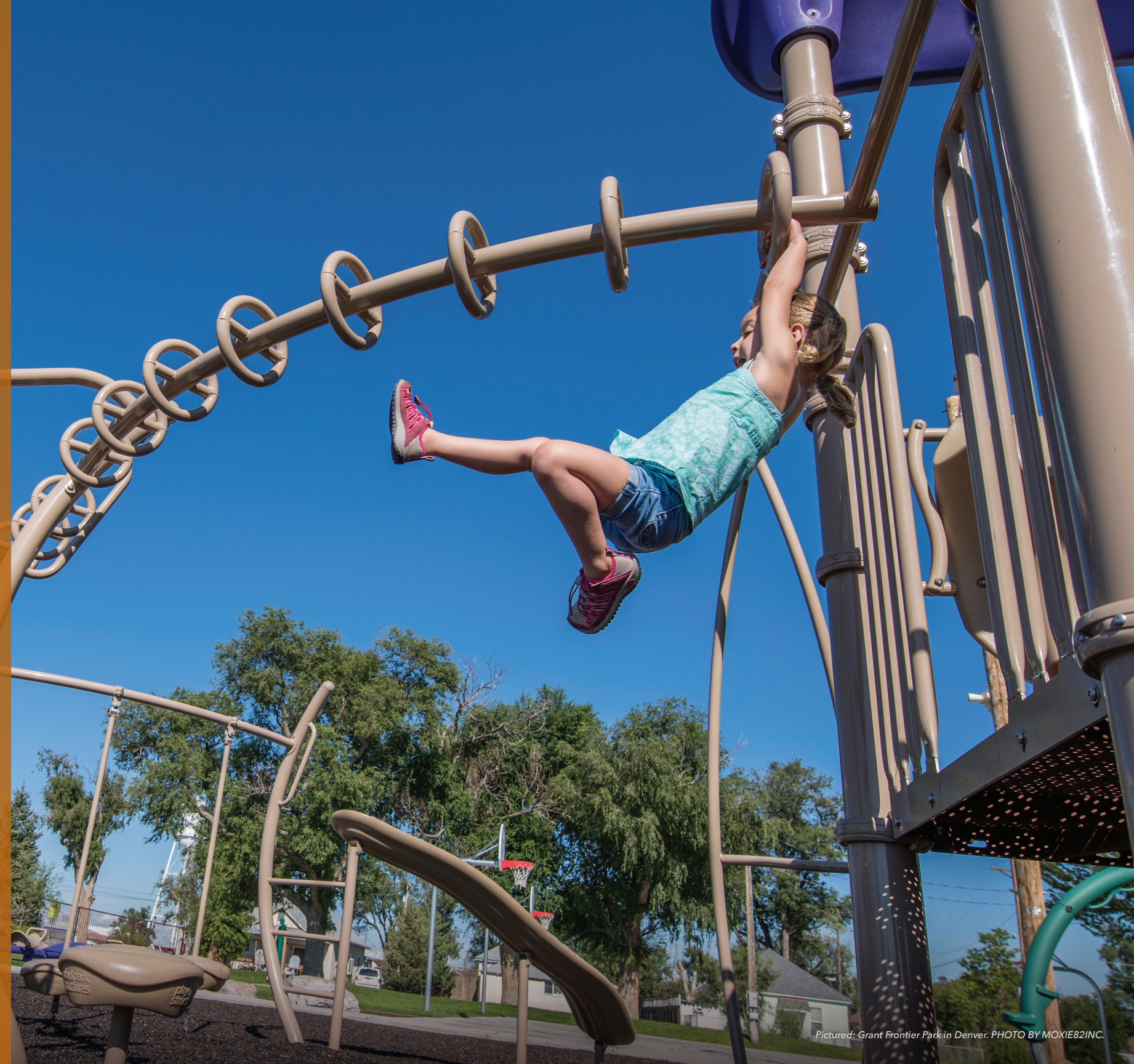
Pictured: Grant Frontier Park in Denver.

We do this by continuing our work to conserve land for people and wildlife and by building trails and parks that ensure equitable access to the outdoors for every person lucky enough to call this spectacular state home.