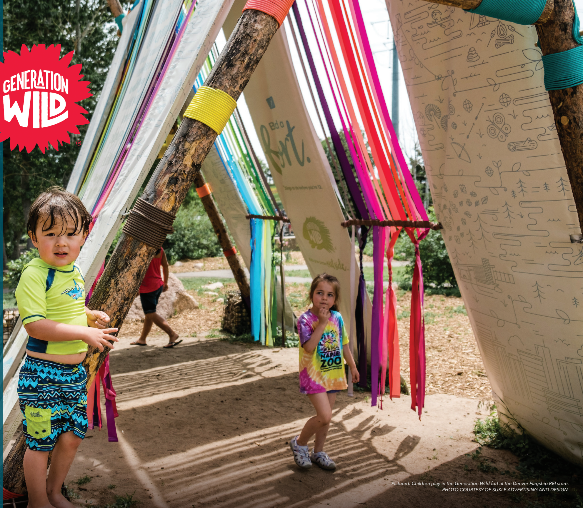
Pictured: Children play in the Generation Wild fort at the Denver Flagship REI store.