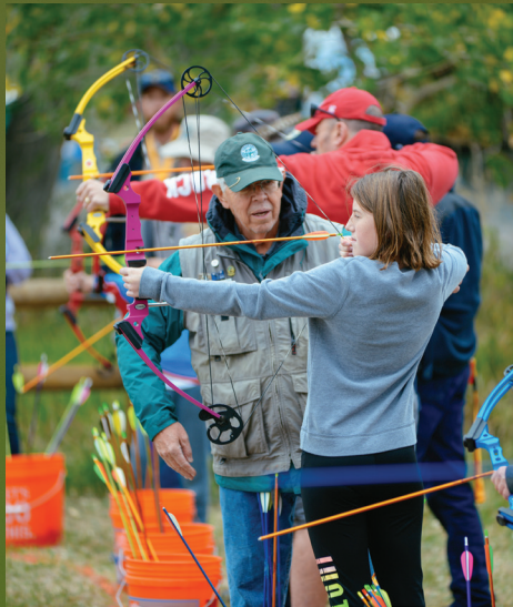
A CPW volunteer teaches a girl how to shoot a compound bow at the first-ever Outdoor Adventure Expo, hosted by CPW at Cherry Creek State Park.

That funding supports efforts to preserve and improve wildlife habitat and to help protect the hundreds of diverse species that call our state home.