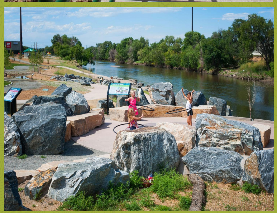
Greenland Ranch by Douglas County; Colorado Riverfront Trail by Town of Palisade; Steamboat Springs Including Yampo River and Core Trail by Noah Wetzel; South Platte Riverfront Parks by DHM Design/Jamison Gale.